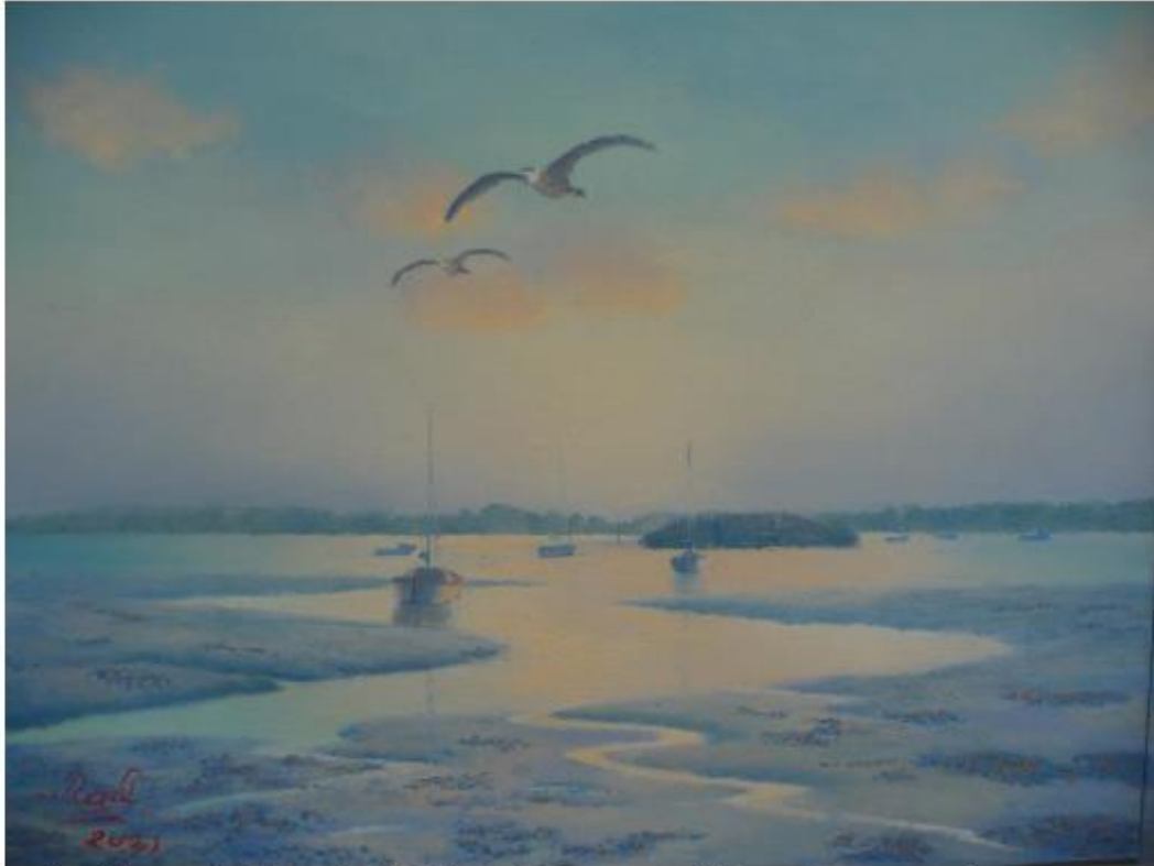
Lockdown Art from Rod Bailey – the protected Brent Geese over Langstone Harbour

No Forum Activities are planned due to Covid, except our first community magazine for a year, featuring the development plans for St James Hospital.