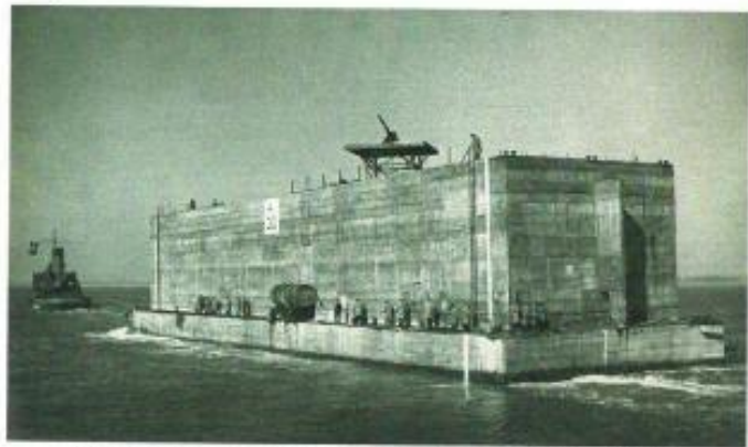
Phoenix caissons, part of the Mulberry Harbours afloat.

To find out more about the route and each of these sites why not go to www.miltonportsmouth.info to read the details and follow the trail. It should take about an hour depending on how long you spend in the Cemetery. It's a great way to enjoy the spring weather